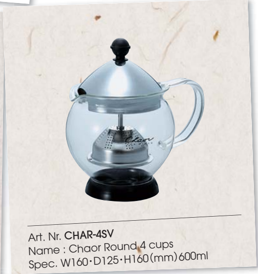
Art. Nr. CHAR-4SV Name : Chaor Round 4 cups Spec. W160·D125·H160(mm)600ml