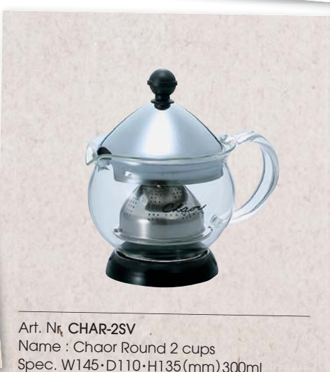
Art. Nr. CHAR-2SV Name : Chaor Round 2 cups Spec. W145·D110·H135(mm)300ml