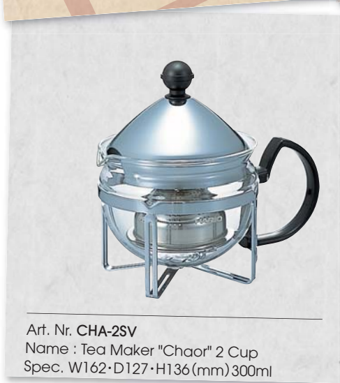
Art. Nr. CHA-2SV Name : Tea Maker "Chaor" 2 Cup Spec. W162·D127·H136(mm)300ml