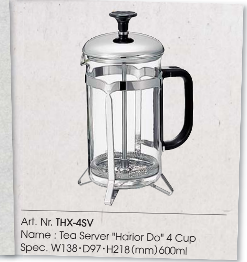
Art. Nr. THX-4SV Name : Tea Server "Harior Do" 4 Cup Spec. W138·D97·H218 (mm)600ml