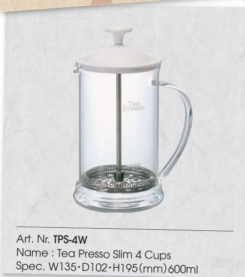
Art. Nr. TPS-4W Name : Tea Presso Slim 4 Cups Spec. W135·D102·H195(mm)600ml