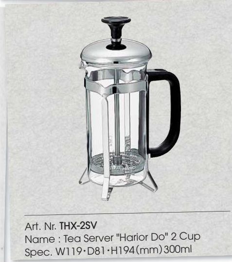
Art. Nr. THX-2SV Name : Tea Server "Harior Do" 2 Cup Spec. W119·D81·H194(mm)300ml